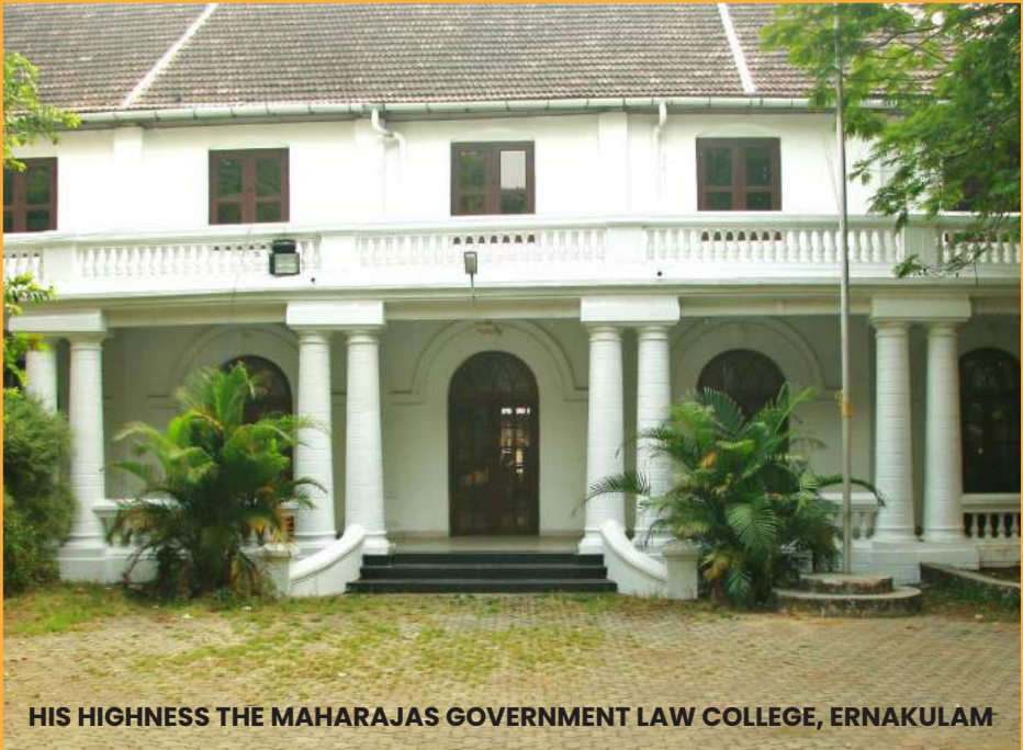
HIS HIGHNESS THE MAHARAJAS GOVERNMENT LAW COLLEGE, ERNAKULAM